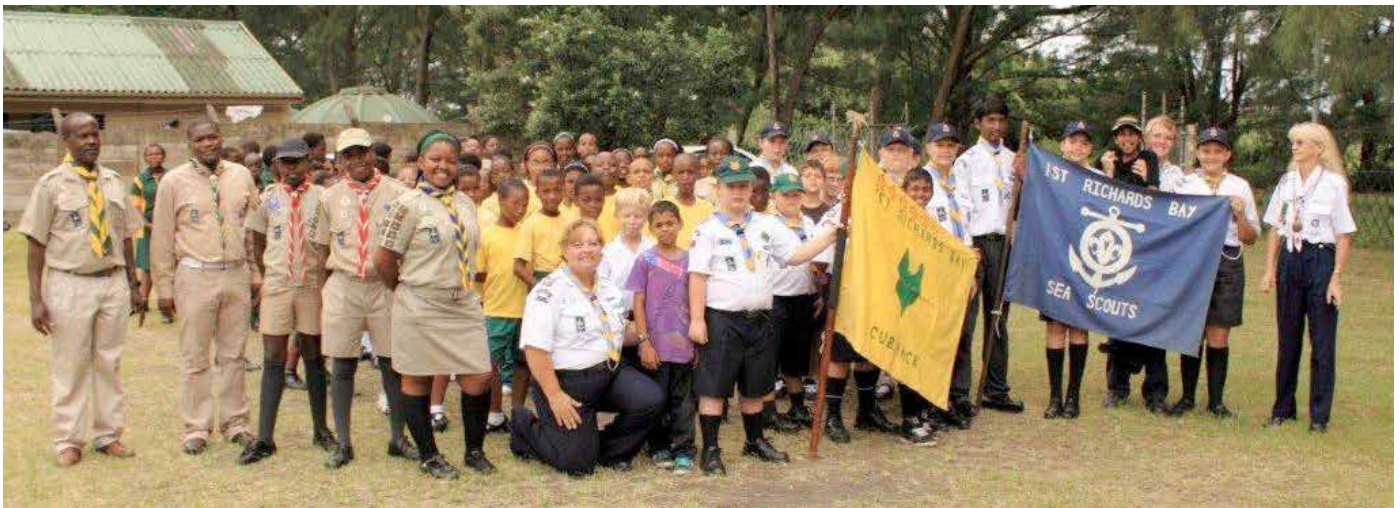
The Zululand District pose for a group photo just after the BP Sunday service.